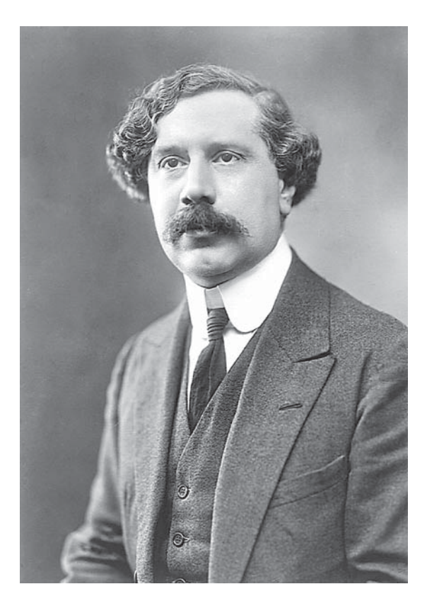
Fig. 5. Charles Foix after the war.

Foix was promoted to médecin major de 2e classe in April 1918 and was finally assigned in September 1918 to Zeitenlik Hospital No. 2, the Salonika neurology centre [41].