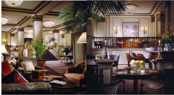
Views of the lobby of the Francis Marion Hotel.

The structure of the ISHN meeting will be platform and poster papers as well as thematic symposia, all to be refereed by the program committee. Platform papers are normally about 15-20 minutes in duration followed by 5-10 minutes for discussion. Thematic symposia consist of 3 or 4 platform papers submitted together on a specific theme. Poster papers will be displayed on a poster board whose size is yet to be determined. The program will include several invited papers.